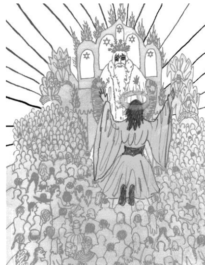
Son of Man Receiving the Kingdom