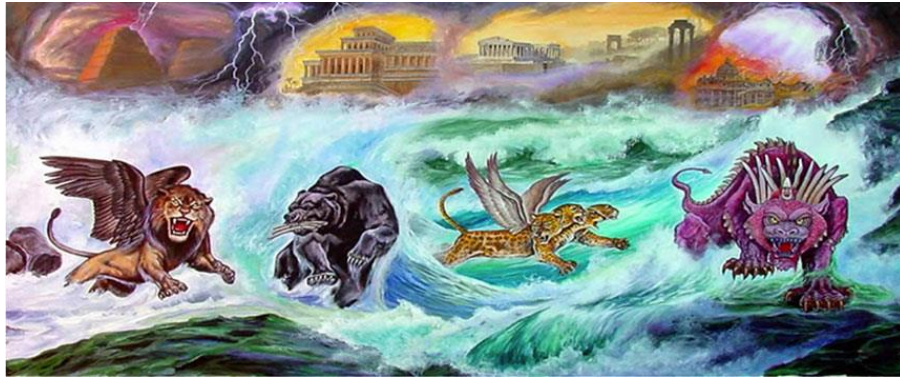
Daniel's Four Wild Beasts

Revelation 11:15 And the seventh angel sounded; and there were great voices in heaven, saying, the kingdoms of this world are become the kingdoms of our Lord, and of his Christ; and he shall reign for ever and ever.